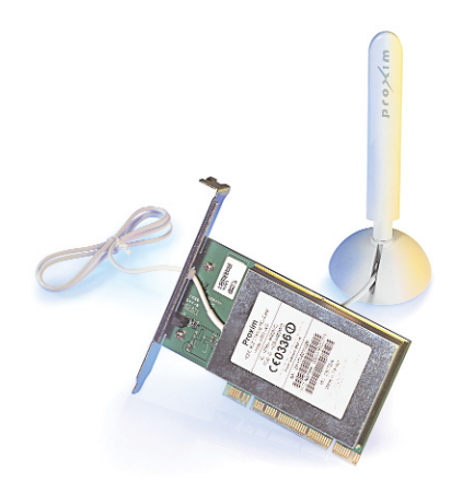
PCI Card with External Antenna